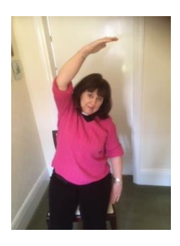
Tilt head towards right shoulder- hold for count of 5-8. Repeat to other side

Reach arm over head to side. Don't hold your breath. Hold for a count of 8 Repeat with your other arm